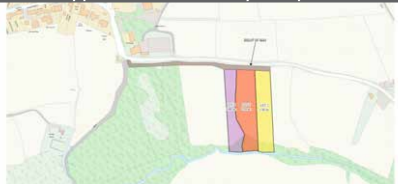
About 11/4 acres of gently sloping amenity land on the outskirts of the village of Shop, not far from the North Cornish coast.

Land at Shop (LOT 2) Morwenstow, Bude | Auction Guide Price £15,000 For sale by public auction - Wednesday 17th April